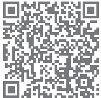
Schnitzer named 2011 Scrap Company of the Year by American Metal Market

Overall, these commitments and practices deliver value to our entire recycling ecosystem year after year. We invite you to learn more by reading this brochure and visiting us online at: www.schnitzersteel.com